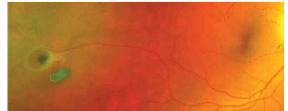
Myopic retinal degeneration, including retinal holes and retinal detachment, are more common among Asian-Americans, a major component of Arcadia's population.