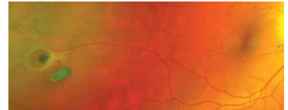
Myopic retinal degeneration, including retinal holes and retinal detachment, are more common among Asian-Americans, a major component of Arcadia's population.